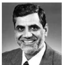
M. C. Mehta Supreme Court Advocate, Indian Center for Enviro- Legal Action (ICELA)