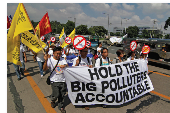
Top Right: Bottom Right: