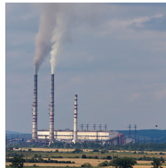
Coal-fired power plant Burshtyn TES, Ivano-Frankivsk Oblast, Ukraine.

"EPL's work to strengthen the rule of law in Ukraine is truly impressive," says Killian. "The EPL team works tirelessly to improve and enforce the law and to protect the climate."