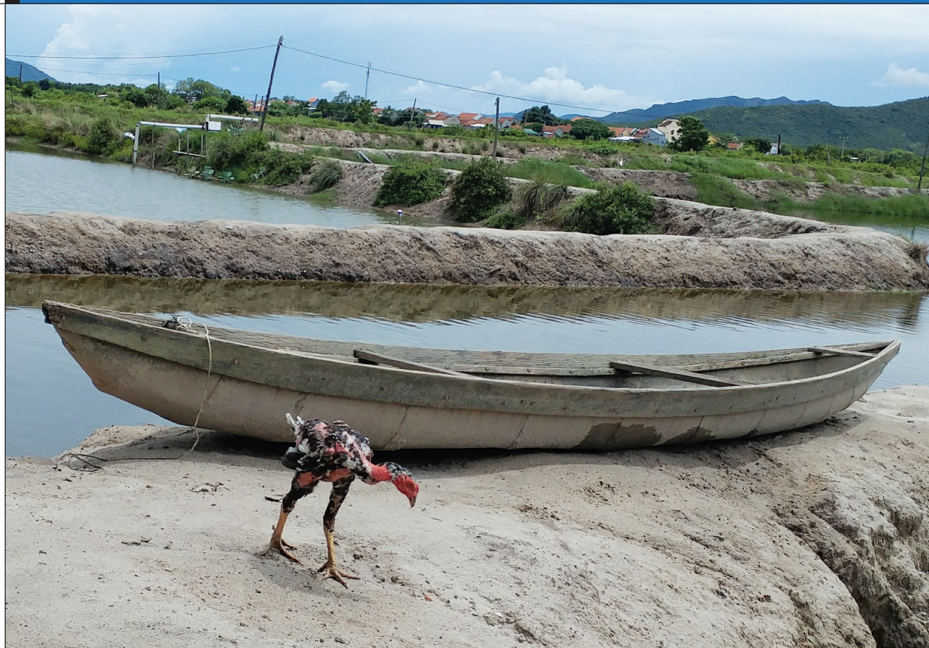
Aquaculture ponds for whiteleg shrimp ( Litopenaeus vannamei ) cover the landscape north of Nha Trang, Vietnam. By the end of the century, these ponds could be inundated by sea level rise.