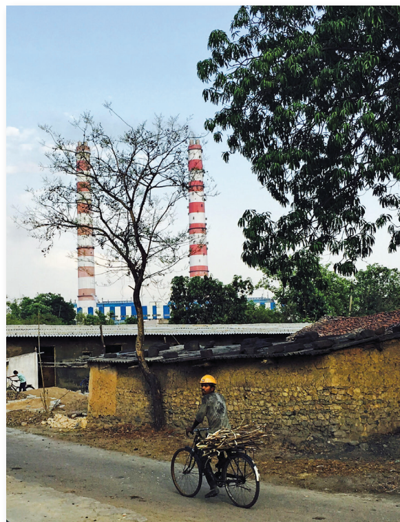
A coal-fired power plant in Chhattisgarh, India.

At a recent hearing, the Tribunal asked the Ministry about considering the impact on climate change of issuing environment and forest clearances. The Ministry is expected to file an affidavit about this issue before the next hearing. ELAW stands ready to support our partners in India as this case advances.