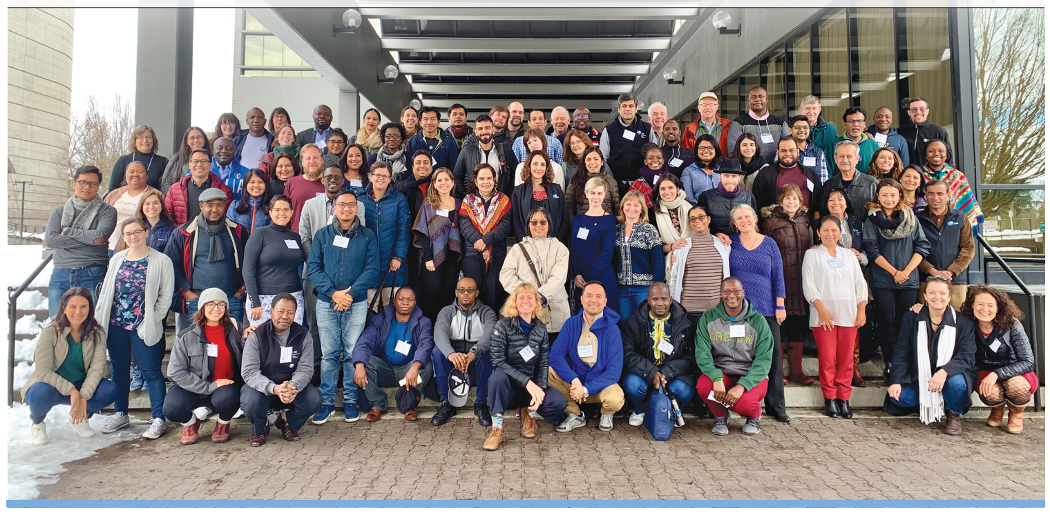
In spite of record snowfall the week of the 2019 ELAW Annual Meeting, participants found a dry spot for this group photo.