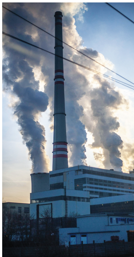
Chvaltice coal-fired power plant, Czech Republic.

We cannot afford to backslide on climate commitments. Congratulations to Frank Bold and The Czech Climate Litigation association for holding the Czech government accountable.