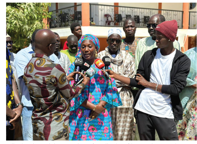
Following the workshop, members of a collective of impacted community members are interviewed by local journalists.

that the plant in Ndiakhatt is failing to follow these practices. Dr. Lu detailed a strategy for collecting and analyzing samples of soil near the plant in order to document the health hazard of the plant's operation, and the need for a prompt and comprehensive