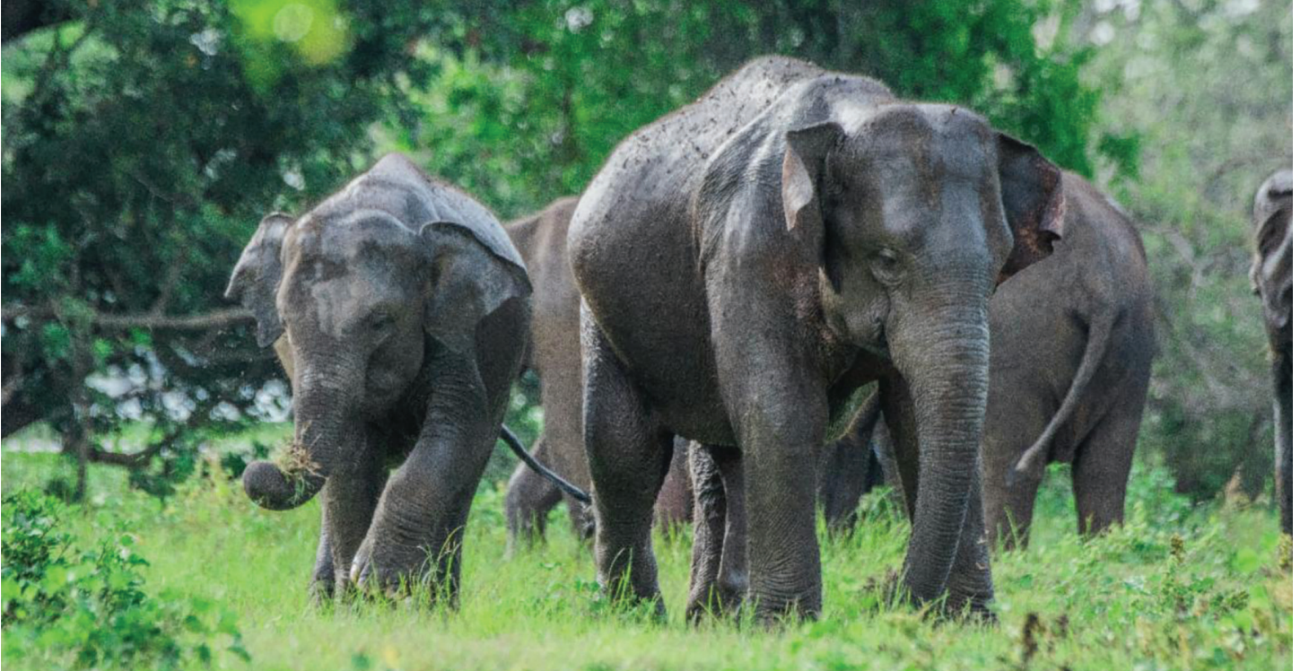
Elephants, forests, and local communities will now be protected.