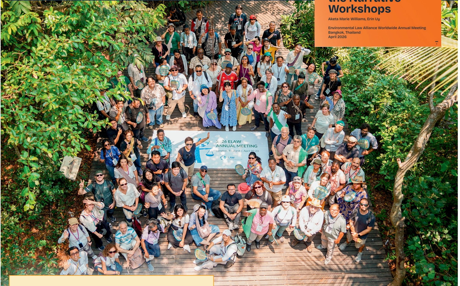
Sri Nakhon Khuean Khan Park on the Chao Phraya River.

Environmental Law Alliance Worldwide Annual Meeting Bangkok, Thailand April 2026