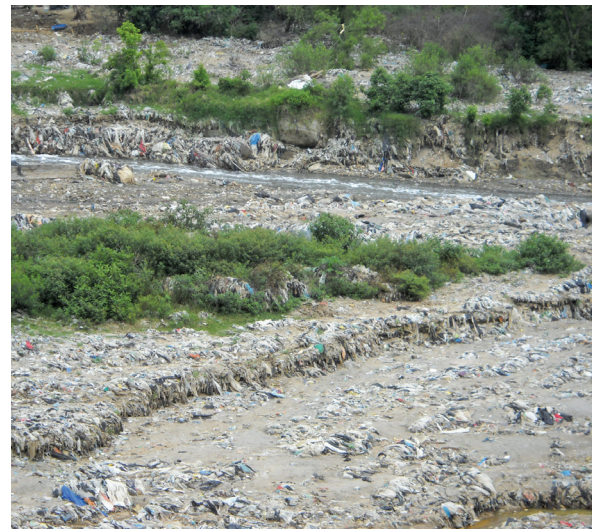
Solid waste litters the banks of the Motagua River.

Many thanks to the Summit Foundation for supporting this work!