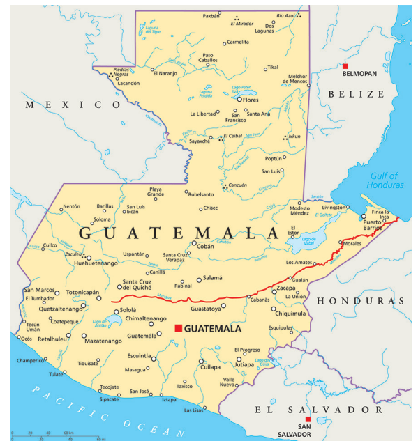
Red line maps the path of the Motagua River.