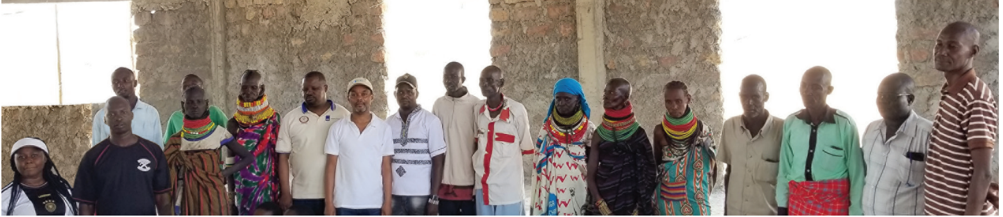
ELAW partners in Kenya join community members and petitioners impacted by oil development in Turkana County.