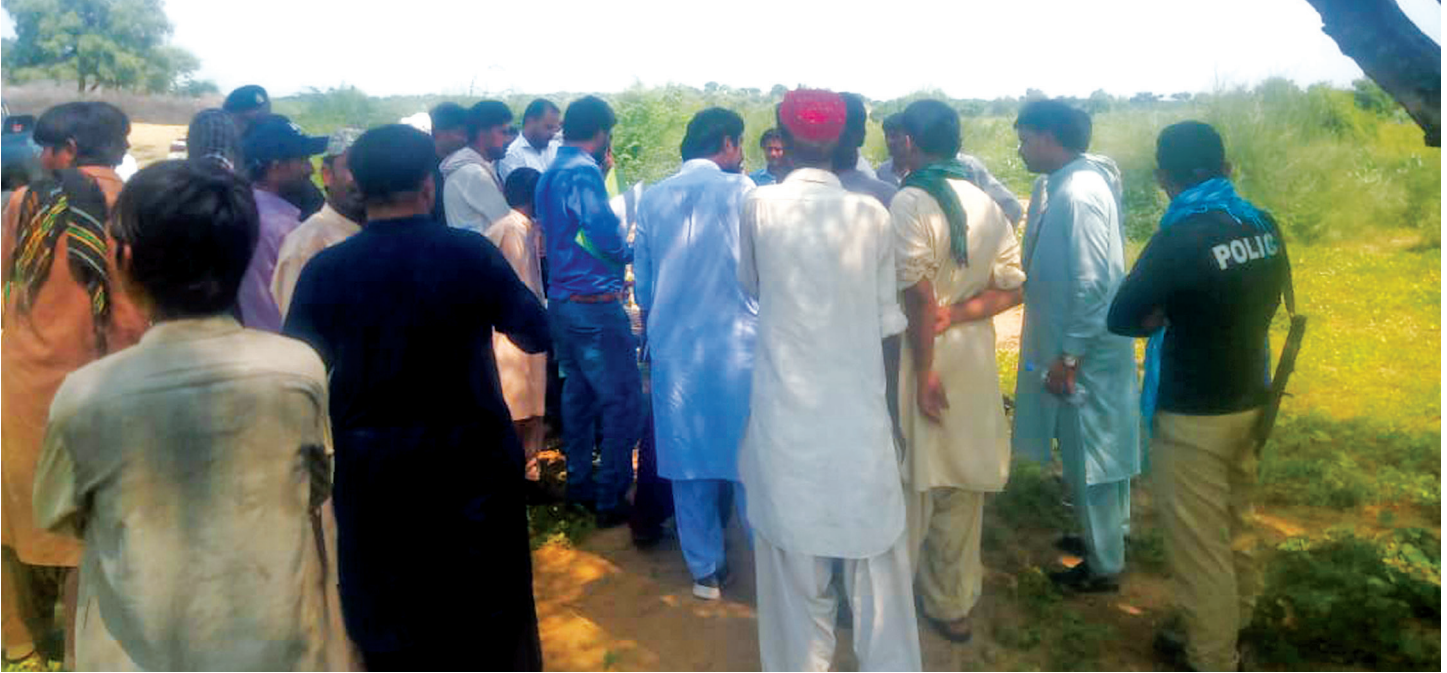
A Sindh High Court Officer visited the affected site on directions to prepare a report.