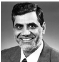
M. C. Mehta Supreme Court Advocate, Indian Center for Enviro- Legal Action (ICELA)