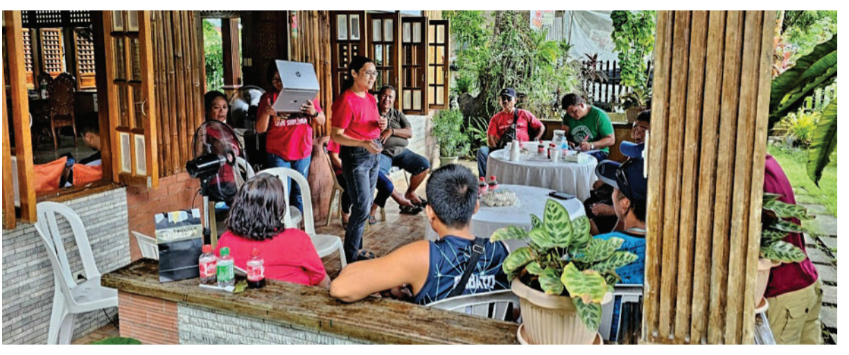
Attorneys at ULAN prepare defenders for hearing.