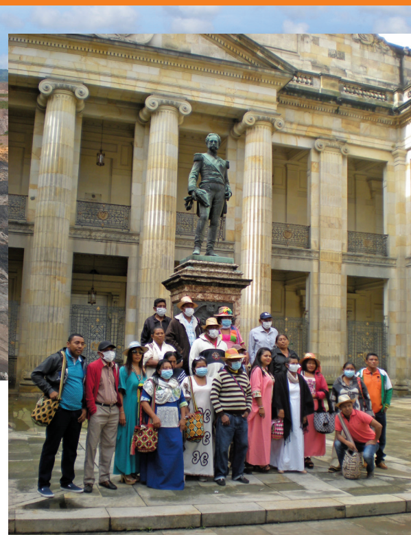
In 2017, the Wayúu gather outside Colombia's Congress, wearing face masks to protest air pollution from mining operations in La Guajira.