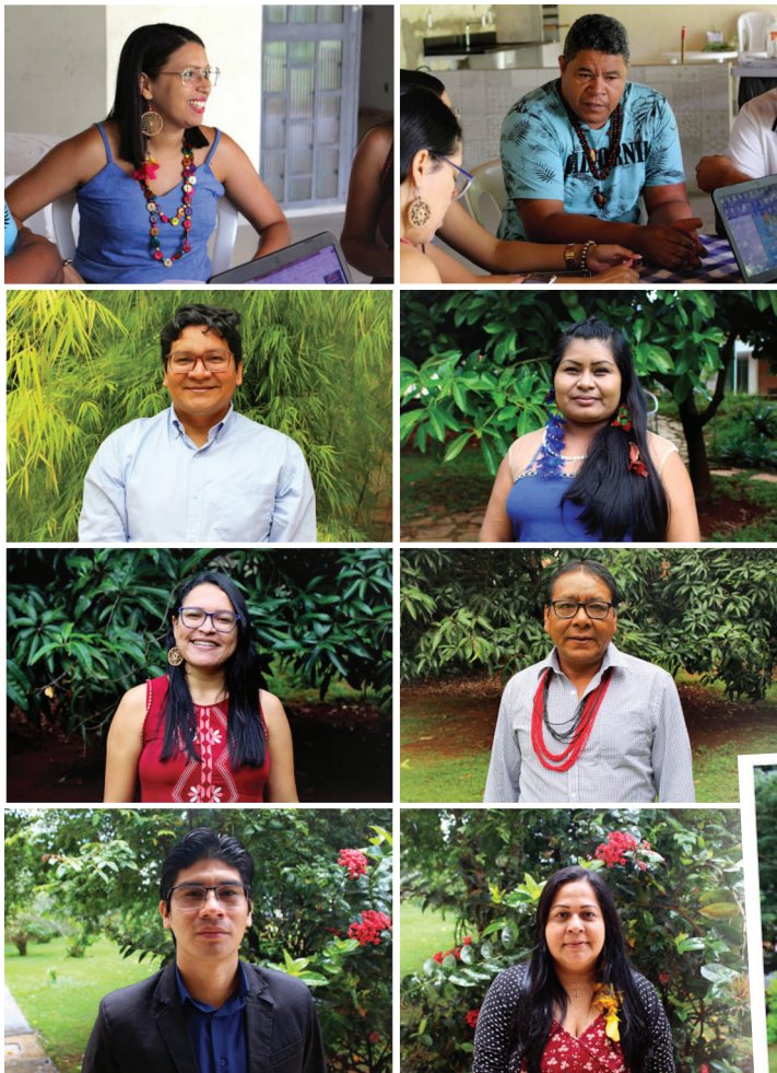
Above: Representatives of Indigenous groups from the Amazon region and other areas of Brazil are participating in the training program.

ELAW remains committed to collaborating with our Brazilian partners to advance environmental and human rights advocacy.