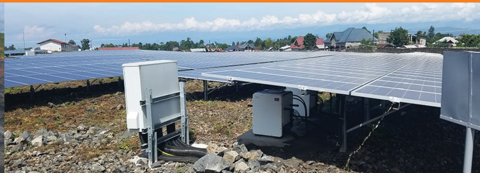
New solar hybrid project in Goma, DRC.