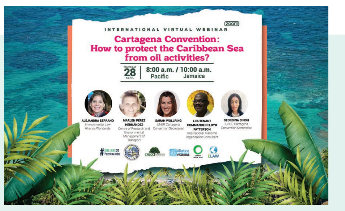
Cartagena Convention: How to Protect the Caribbean Sea from Oil Activities

The Convention for the Protection and Development of the Marine Environment in the Wider Caribbean Region (Cartagena Convention) is a regional legal agreement for the protection of the Caribbean Sea. ELAW is working with the Secretariat of the Convention to raise awareness of the Convention in Caribbean countries where ELAW partners are working to protect ocean and coastal ecosystems.