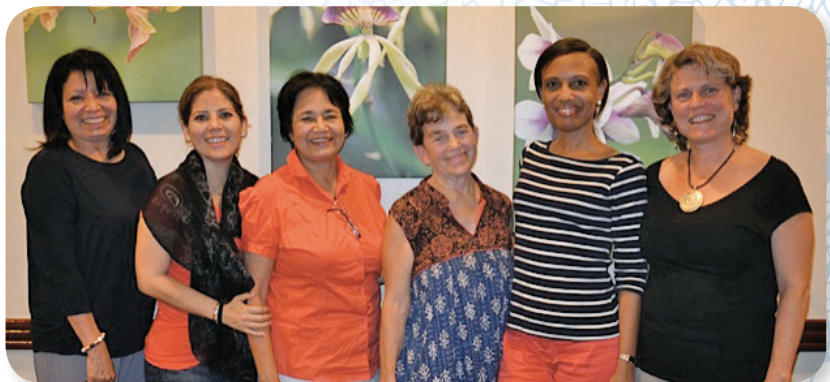
Advocates from Guatemala, Mexico, Honduras, Belize and the US are working together to protect the reef and coastal watersheds in the MAR region.