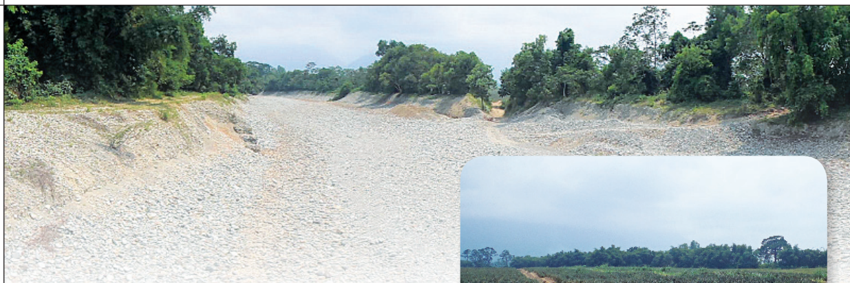
Drainage channels from Agropor's pineapple plantation in El Provenir flow into the Coloradito River, now dry. The pollution winds its way past downstream communities along the Juan Lopez and Zacate Rivers, then into the Caribbean Sea.

Q & A with ELAW extern Meiling Zhang (pg. 7)