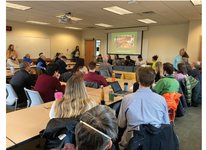
While in Eugene, the Fellows shared their work at a panel at the University of Oregon Public Interest Environmental Law Conference (PIELC): "Protecting Indigenous Lands in Brazil."