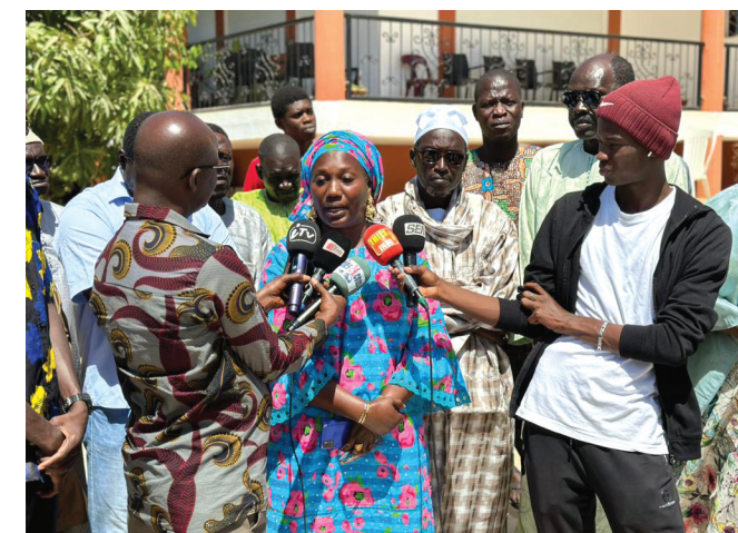
Following the workshop, members of a collective of impacted community members are interviewed by local journalists.

that the plant in Ndiakhatt is failing to follow these practices. Dr. Lu detailed a strategy for collecting and analyzing samples of soil near the plant in order to document the health hazard of the plant's operation, and the need for a prompt and comprehensive clean-up.