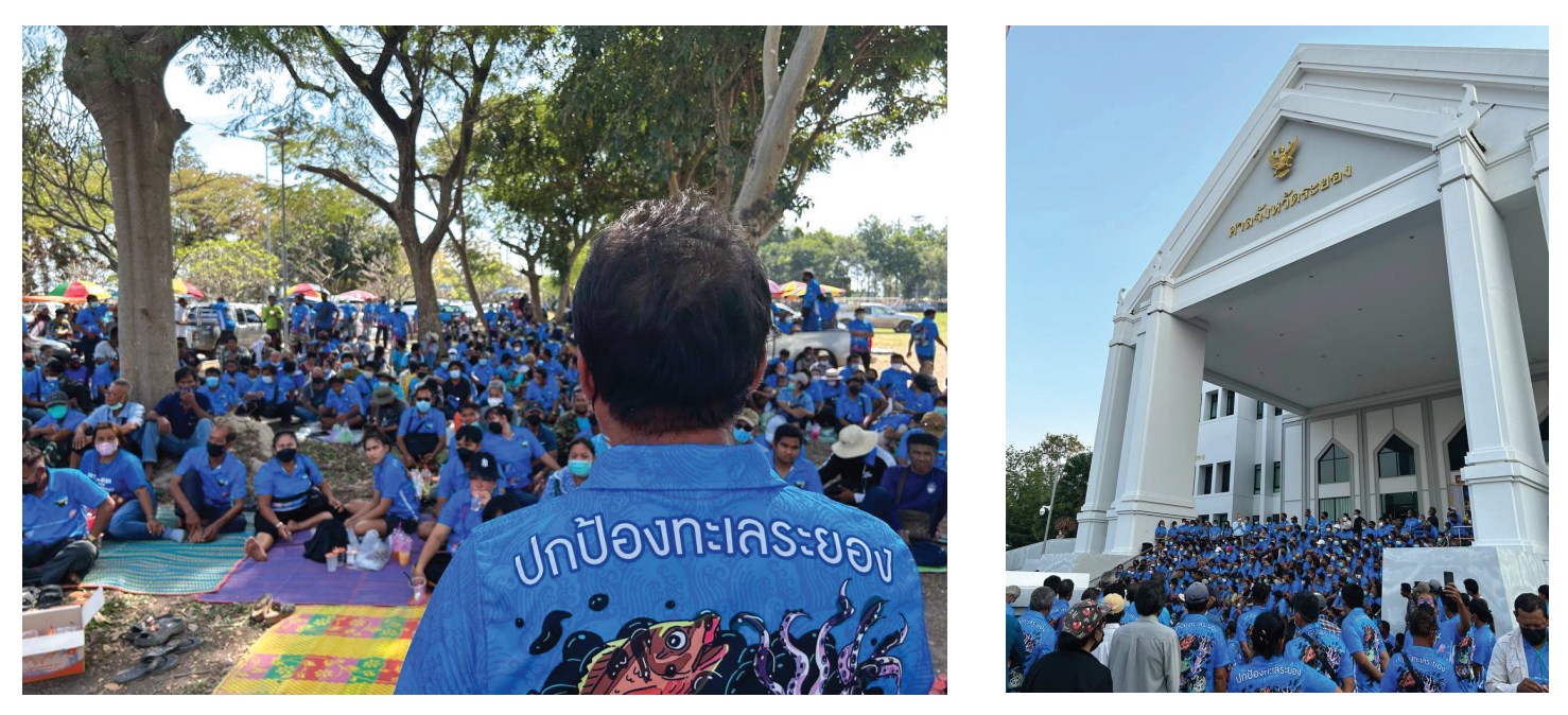
Plaintiffs wait for news near the Rayong Administrative Court, January 2023. Their blue shirts say: "Protect Rayong Sea."

We will keep you informed of Rising Sun's progress in this challenging case.