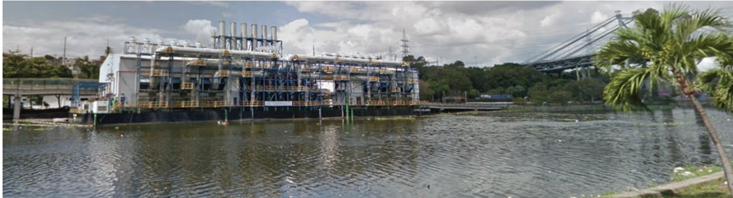
Estrella de Mar II. PHOTO: Image capture: Feb 2019 © 2021 Google (see page 1)