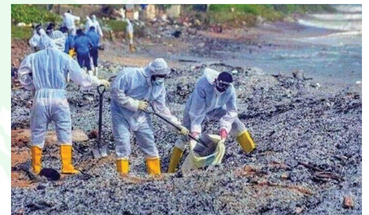
Polyethylene pellets litter Sri Lankan beaches.

In May 2021, the X-Press Pearl container ship caught fire off the coast of Colombo and sank, releasing toxic chemicals and littering Sri Lanka's coastline with polyethylene pellets. The incident was deemed the worst marine ecological disaster in Sri Lankan history and the largest chemical ship accident in the world. ELAW partners with the Centre for Environmental Justice (CEJ) have since filed public interest suits in Sri Lanka's Supreme Court and Appeals Court, seeking the establishment of a commission to assess the extent of the damage caused to the nature, fishing communities, and the tourism industry. ELAW has collaborated with CEJ for many years to protect the environment through law in Sri Lanka.