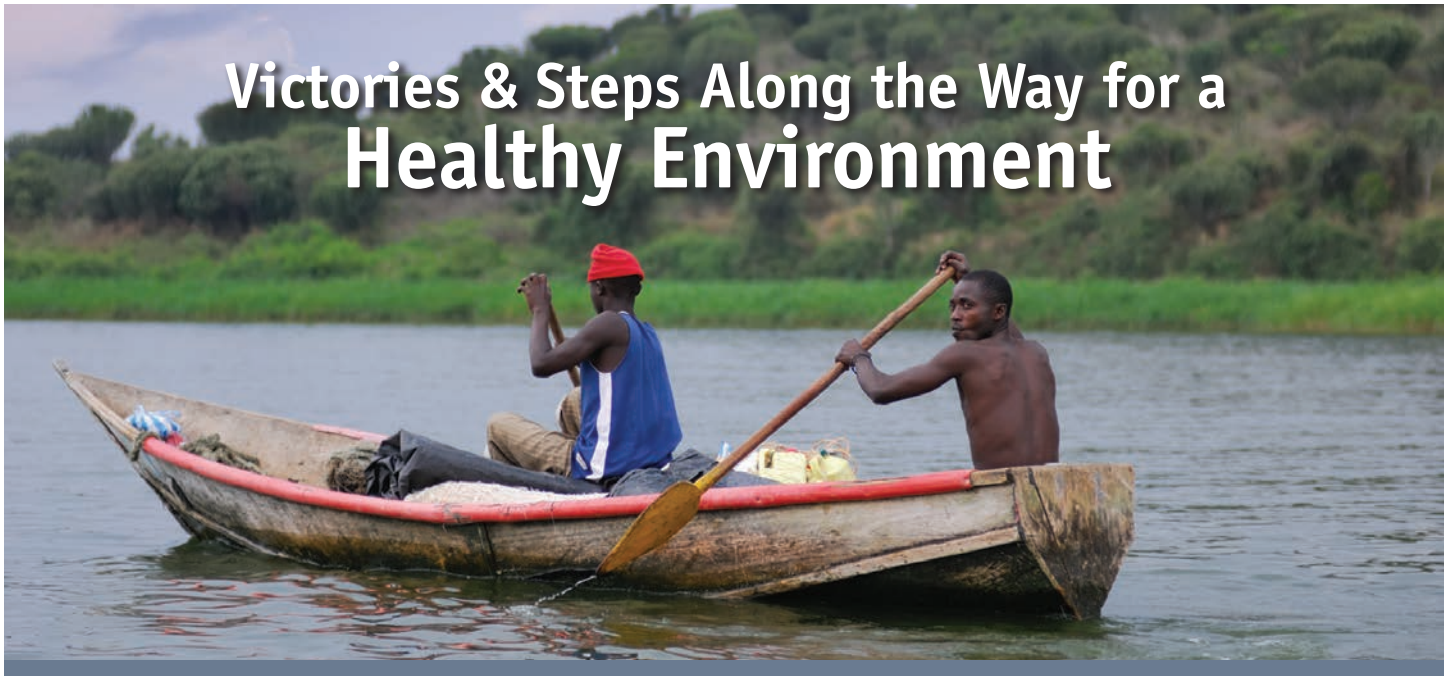
Fishermen on Lake Edward in Virunga National Park in the Democratic Republic of Congo.