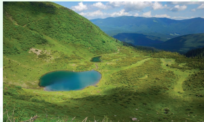
Lake Vorozheske, Svydovets massif.

Moving forward, Miłosz says his organization plans to speed up the energy transition in Poland, including closing existing mines.