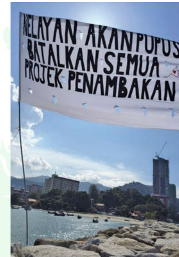
"Fisherfolk will disappear. Cancel all reclamation projects."