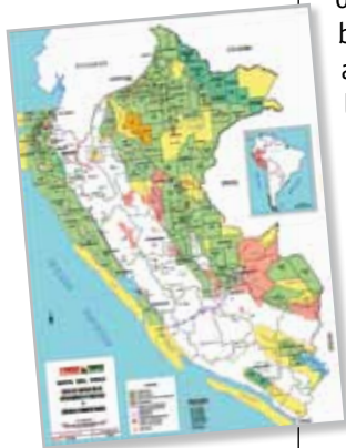
Peru’s oil concessions (in green).

“People are concerned about the impacts of extractive industries. There is a lot of tension due to a lack of public participation in decisions being made. The aim is to help communities protect waterways, rainforests, and ancient ways of life, before it’s too late,” says Meche.