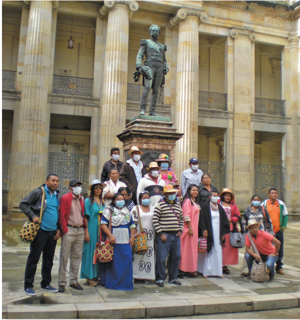
Wayuu peoples gather outside Colombia's Congress, wearing face masks to protest air pollution in La Guajira.

Wayuu children in Colombia are suffering from respiratory problems allegedly tied to operations of Latin America's largest open pit coal mine - the Cerrejón mine in La Guajira. ELAW drafted an amicus curiae brief for the Colombian Court supporting constitutional claims on behalf of the children whose health is endangered by the mine.