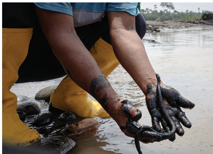
An oil spill in January 2022 polluted the Coca River.

"We asked the Constitutional Court for urgent justice," she said. We will keep you posted as the case proceeds.