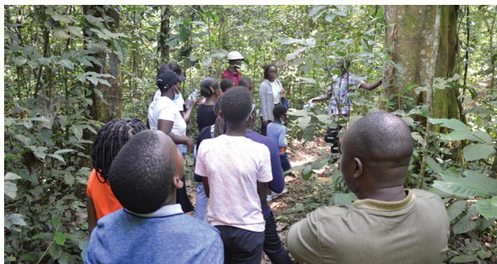
Greenwatch staff conduct a site visit to Mabira Central Forest Reserve.

Forests are shrinking in Uganda. In the 1980s, 30% of the nation was forest. Today, forests cover less than 8%.