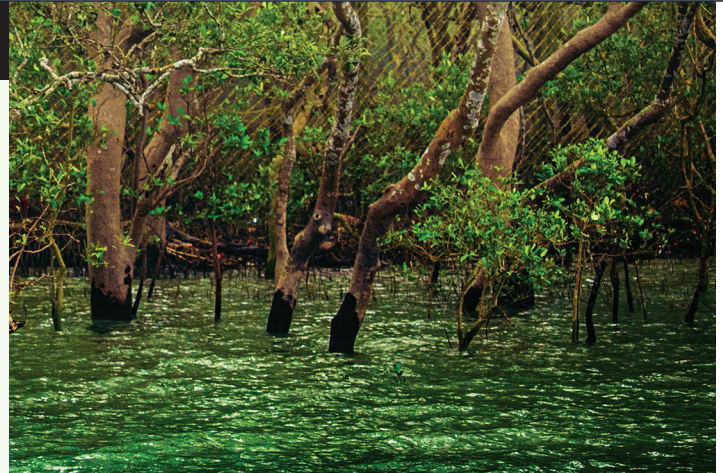
Sundarbans, West Bengal, India.

“The Sundarbans has hundreds of islands. We traveled to the village of Gosaba where residents are building embankments to hold back the sea water The town will likely be submerged within a few years”.