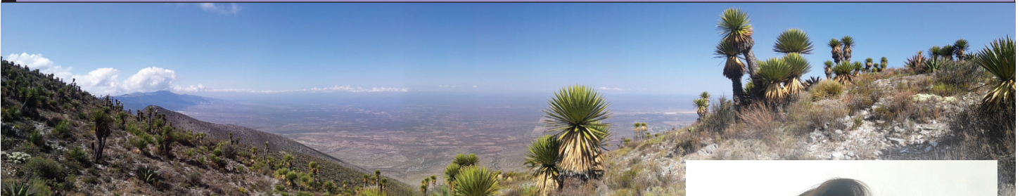
Wirikuta sacred site.

ELAW's inaugural Killian O. Doherty Environmental Justice Fellow joined our team in January!