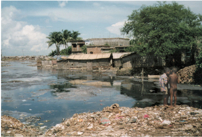
Children near tannery operations in Hazaribagh.